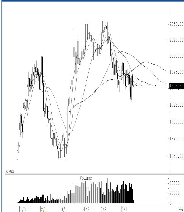
GOM23 (Close 1,953.90 Chg -1.80)

ราคาทองคำโลกแกว่งออกด้านข้าง เราแนะนำการดสูงหรือตั้ง stop ใว หรือแนะนำ trading ในกรอบ 1,975-1,940 ดอลลาร์ รับรู้กำไร แต่ถ้าในกรณีนี้ที่ ปิดต่ำกว่าระดับ 1,940 ดอลลาร์ แนะนำ ถือ short หวังผลปรับตัวลงไป แถว ๆ 1,900 ดอลลาร์ รับรู้กำไร